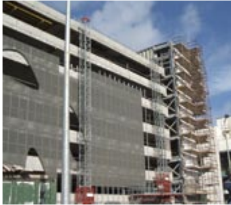
Construction in full swing at the White Water Shopping Centre.

To support this development, the road network needed to be upgraded and improved, which is currently causing temporary inconvenience to consumers and business alike. We hope it will be worth it all when the new