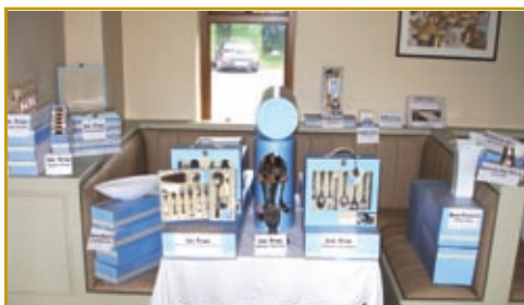
The glittering prize table