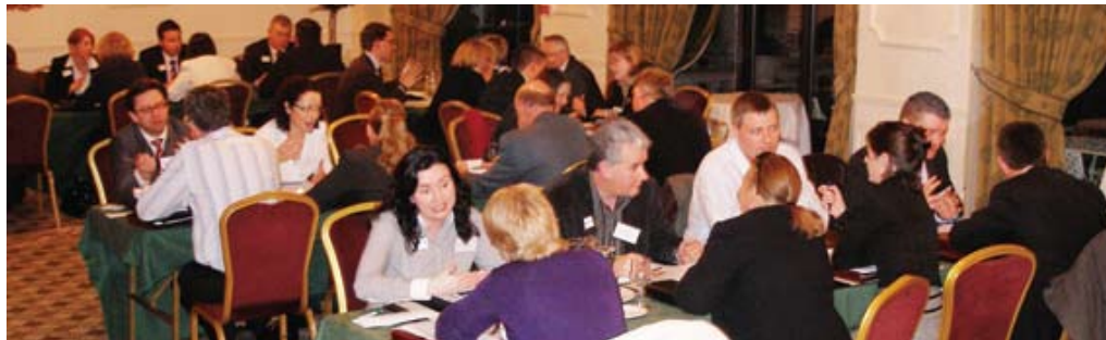
Networking at speed on 22nd January last!

“To everything there is a season, And a time for every purpose under heaven...”