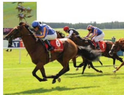
Frozen Fire flies by to win the 2008 Dubai Duty Free Irish Derby

On Sunday , enjoy the spectacle and excitement of Ireland's greatest international race day of the year with the world's finest thoroughbreds competing for one of the ultimate prizes in Irish sport, the Dubai Duty Free Irish Derby . The best of fashion, entertainment, hospitality and, most importantly, fun combines to make this one of the greatest race days of the year. A fantastic