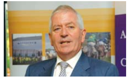
EU Commissioner Charlie McCreevy, Guest Speaker

Commenting on the banking sector, Commissioner McCreevy felt that regulations were too lax throughout the EU and US, not just Ireland. He felt that the solution is to deal with the banking