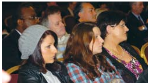
Some of the audience at last month's Local Information evening