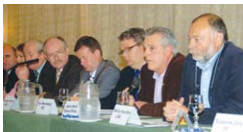
A selection of the crowded top table

used the opportunity to call for a 20% cut in commercial rates in the Newbridge area to enable businesses to stay open and survive the current recession.