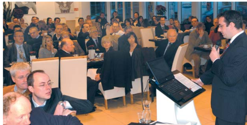
Attendees at Annual Budget Breakfast, The Silver Restaurant